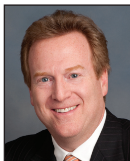
Mitchell Berkey Chiesa Shahinian & Giantomasi